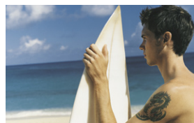
With Vivid Blue